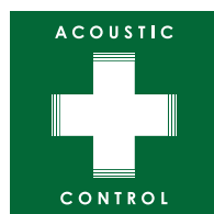
“Acoustic Control” Technology logo mark

“Acoustic Control” is the name of the technology and concept Sonic Design has cultivated; concentrating the sound analysis and correction know-how improve the reproduction environment of the audio system and bring out the systems original potential.